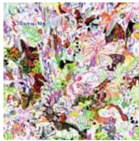
Earthly Delights Lightning Bolt Stomp

A fuller, richer sound than any of the artist's previous releases, as Robbie unashamedly pays homage to some of his musical heroes. The Pet Shop Boys connection, which began with Neil Tennant's backing vocals on No Regrets and continued on Rudebox's cover of We Are The Pet Shop Boys , is evident here again on Last Days Of Disco and, most especially, on Difficult For Weirdos . Album released November 6.