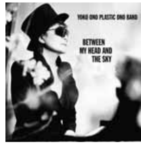
Between My Head & the Sky Yoko Ono Stomp

At 76 years young, Yoko continues to kick ass. This record, made with her new Plastic Ono Band, is a gorgeous, mind-melting blend of styles, restating and sharpening themes while plunging into the always-mysterious future.