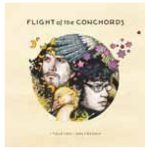
I Told You I Was Freaky Flight of the Conchords Stomp

Lightning Bolt has played stages around the globe. Touring November.