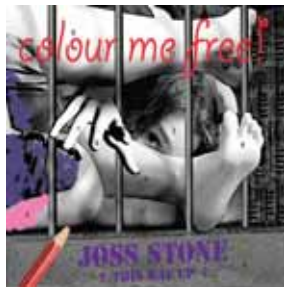
Colour Me Free Joss Stone EMI